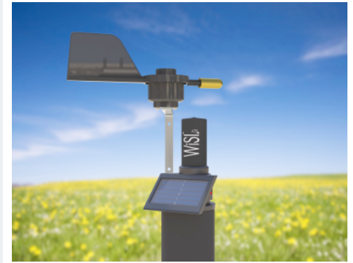
Measuring Wind Speed with an Anemometer Measuring Rainfall with a Tipping Bucket Measuring Wind Direction with a Weathervane

Weather stations are very common in environmental monitoring. Using a single WiSI, wind speed, rainfall and wind direction can be monitored using an anemometer, tipping bucket rain gauge and a weathervane. Additional inputs are available for other sensors such as relative humidity.